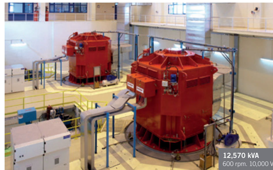
12,570 kVA 600 rpm. 10,000 V.