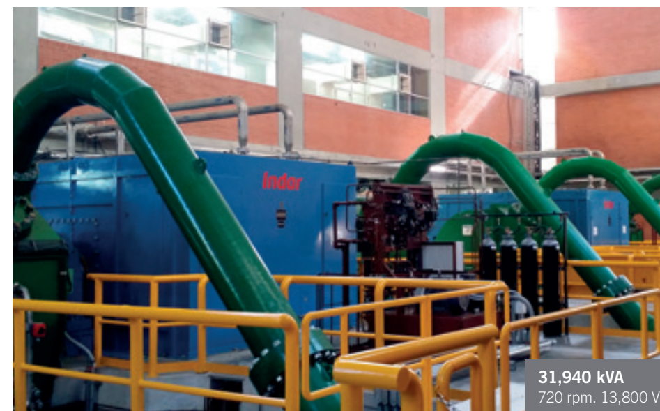
31,940 kVA 720 rpm. 13,800 V.