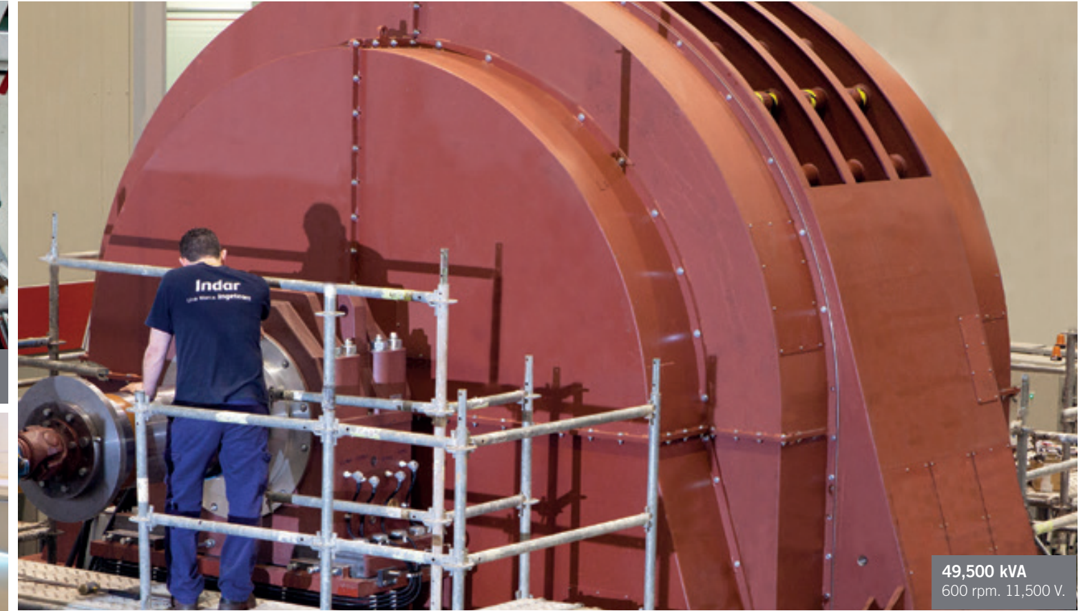
49,500 kVA 600 rpm. 11,500 V.