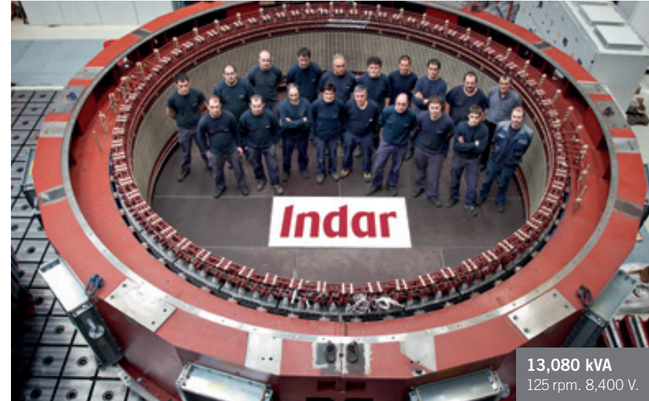
13,080 kVA 125 rpm. 8,400 V.

Redesign of active elements and repowering of generators.